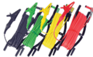
Test lead & reel x4