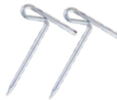
Auxillary spike x2