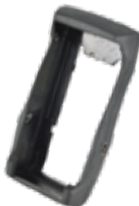
CCO-2700 B (Optional)