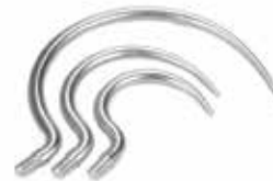
TER-213 100mm TER-213 60mm TER-213 40mm