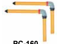
PC-160 Right Angle Adaptors. It can be semi-disconnected for storage into the case. (optional)- Sold by pair