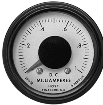
2.5" ■ 250-20