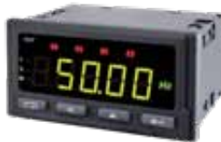
Power & Process Indicators Tank Level Gauges Signal Conditioners