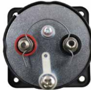
2.5" 635MM DC / AC

Industrial Ruggedized Series was designed to meet industrial requirements where rugged metal cases with glass fronts provide long service under adverse conditions.